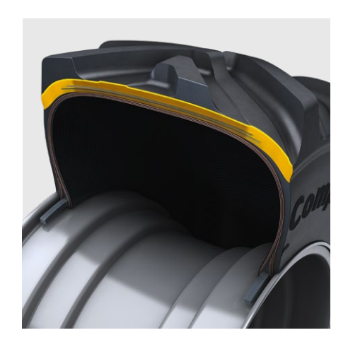
Turtle Shield Shaped Tread Base Line

> For agricultural work with telescopic handlers and compact loaders as universal vehicles on farms