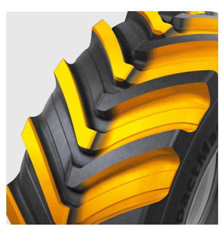
Wide lugs and wide lug base

Protection in center area against foreign objects